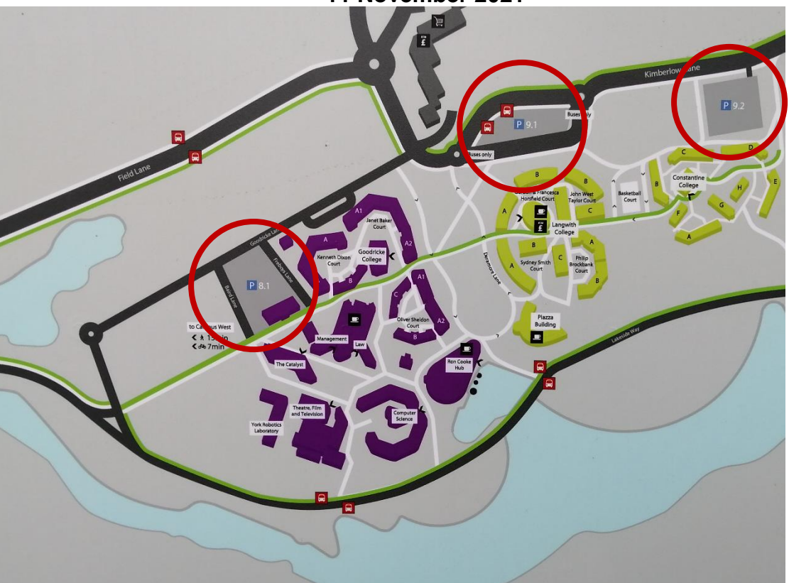
Campus East car parks